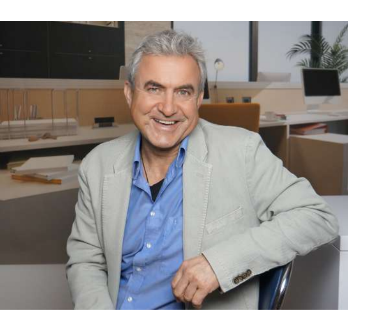
Living Water - Source of Health -Water Is Life - Water Heals! by Johannes Pfaffenhuemer